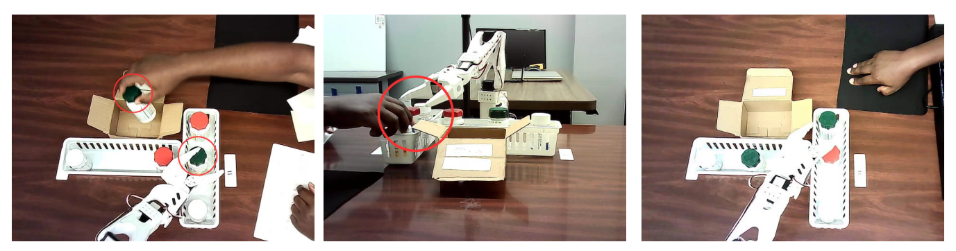
(a) Redundant retrievals