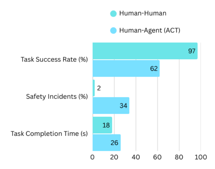
Fig. 3: Performance comparison between Human-Human and Human-Agent (ACT) teams in a collaborative medicationdispensing task. Metrics include task success rate (%), safety incident rate(%), and task completion time (in seconds).

the ACT-based agent's limitations in coordination and transparency compared to human collaboration.